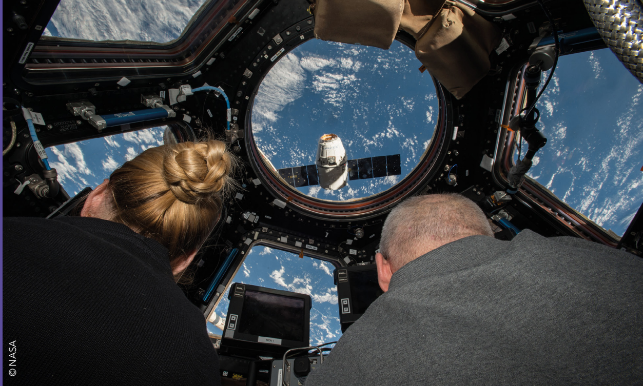
Astronauts aboard the international space station grapple aboard science supplies and hardware, including instruments to perform the first-ever DNA sequencing in space.