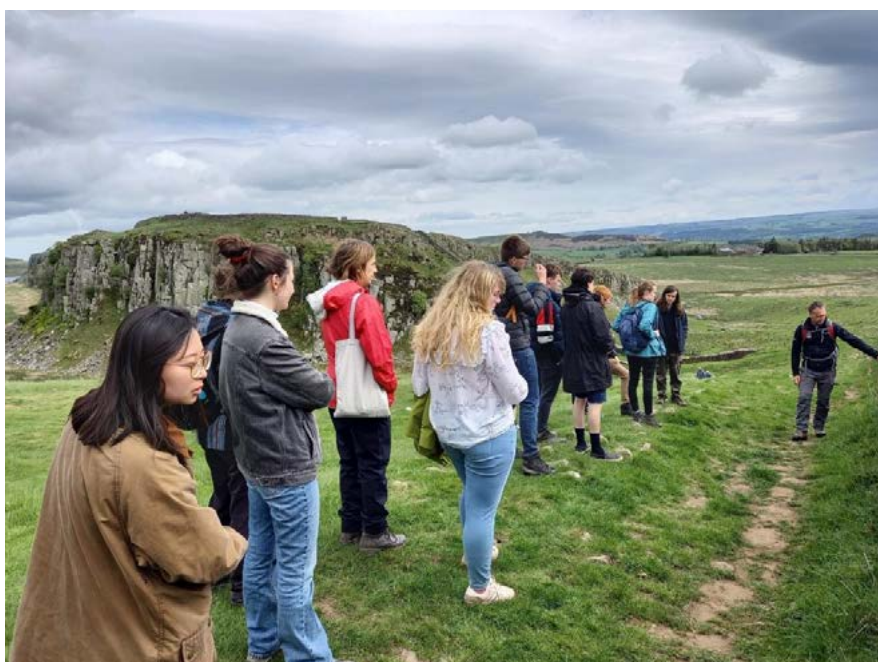
Fig 6a. Hadrian's Wall

The training also provided the YAMS with very useful knowledge to underpin their volunteering roles with Hadrian's Wall partners. A number of YAMS were studying heritage topics at university and were able to apply their learning in higher education settings. YAMS are all about empowerment and giving a voice to young people in the management of World Heritage Sites.