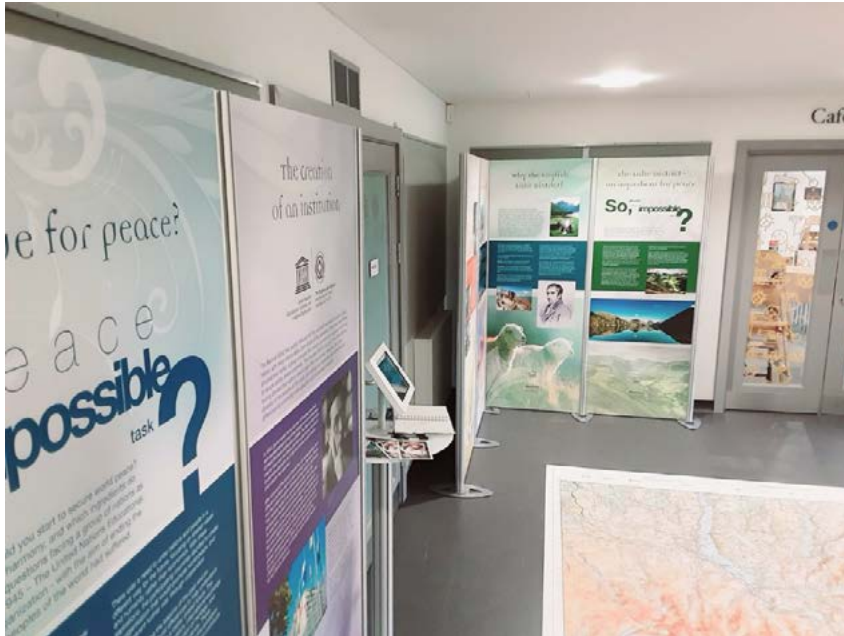
Fig 4A and 4B. Images of Lake district exhibition