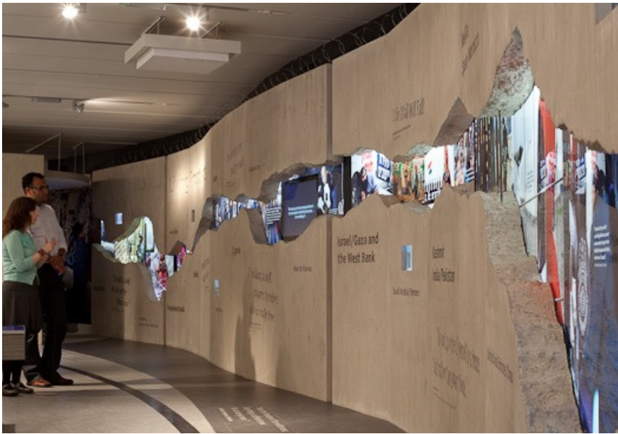
Fig 2. The Living Wall at Tullie House Museum, interpreting Hadrian's Wall