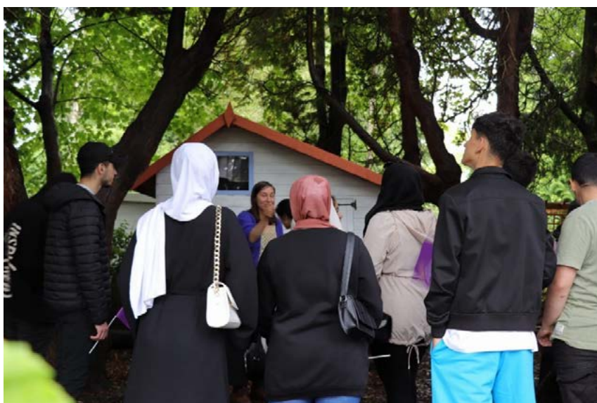
Fig 7.

From November 2021 to October 2022, this project strand encouraged people to come together to transform the Antonine Wall, the former frontier of an Empire, into a community resource, and place of shared belonging.