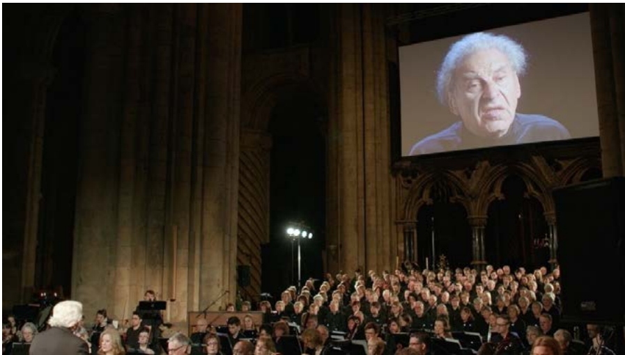
Fig 5. A performance of Verdi's 'Defiant Requiem' in the Cathedral, the audience being addressed by a Holocaust survivor

A number of public events linked to World Heritage and Peace were developed including a performance of Verdi's 'Defiant Requiem' in the Cathedral attended by over 700 people who saw massed choirs and musicians from across the region perform this magnificent work. The event highlighted the story of the Jewish concentration camp victims of Teresin 16 and their resistance to oppression through their performance of this Requiem. As well as images and recorded testimony accompanying the performance, holocaust survivors and their children attended the performance and spoke to the audience.